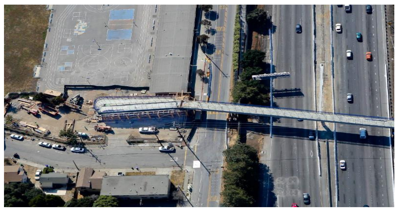
Birdseye view of the soon to be completed Pedestrian Overcrossing at I-80 and Riverside

As part of the San Pablo Dam Road Interchange project, the pedestrian overcrossing construction is well underway, with the bridge deck poured and the false work removed. The new overcrossing is expected to open in October/November 2016. Demolition of the old overcrossing is planned to follow. Work on the El Portal Drive realignment has been completed, including the construction of a new masonry wall. Construction of the new on-ramp at El Portal Drive to westbound I-80 is underway with expected completion in November 2016.