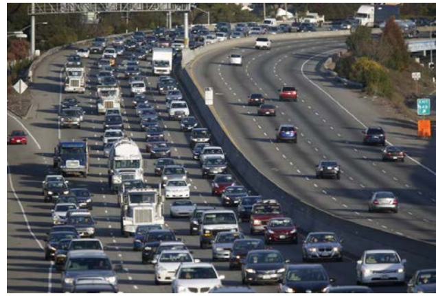
"Bay Area's Worst Commute is Westbound I-80" – San Francisco Chronicle, December 17, 2015

Traffic is routinely congested during peak commute hours in the peak direction, as well as during off-peak hours and weekends when it is congested in both directions. Preliminary estimates indicate that work trips on the I-80 corridor are expected to increase by approximately 23 percent by 2040. Most trips originate from Richmond, San Pablo, Pinole, and Hercules and the three most frequently traveled destination zones external to the Study Area are Berkeley/Emeryville, Northeast San Francisco, and Oakland/Piedmont.<sup>2</sup>