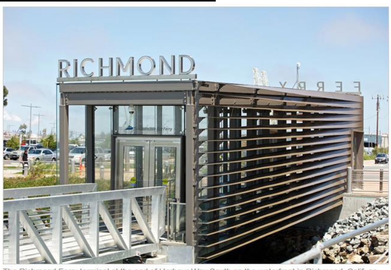
The Richmond Ferry terminal at the end of Harbour Way South on the waterfront in Richmond, Calif. on Friday, June 14, 2019.