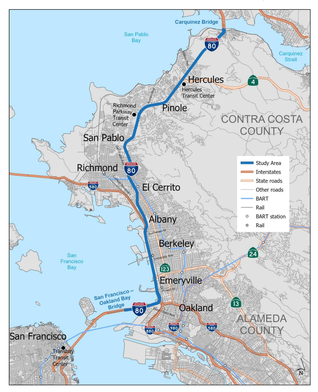
Exhibit 1 – Alameda and Contra Costa I-80 Corridor and Vicinity